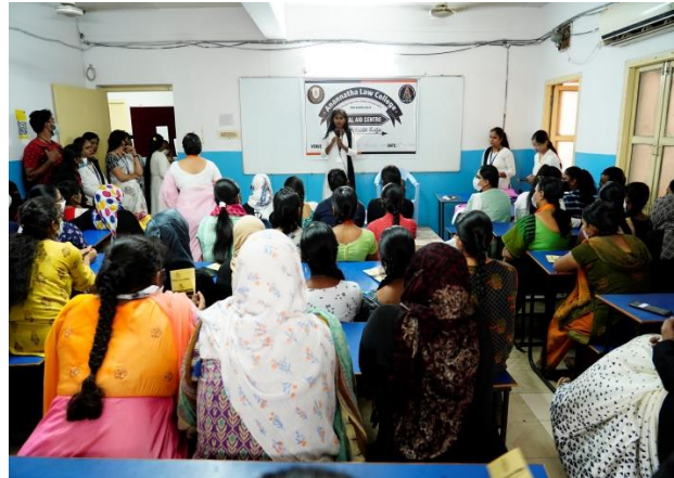
Students of ALCH seen creating awareness of Constitutional Rights Related to women at Pragathi Degree College for Women