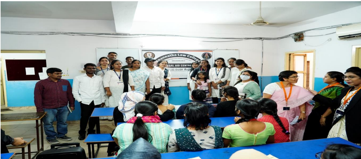
Legal Aid Committee members (Faculty and Students) about to perform a skit