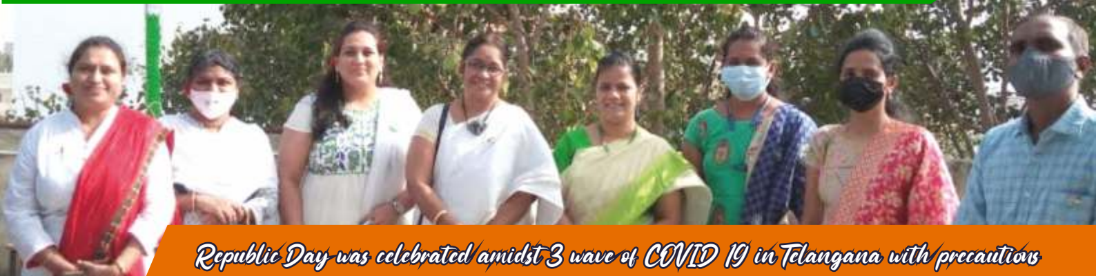
Republic Day was celebrated amidst 3 wave of COVID 19 in Telangana with precautions

Principal of Anantha Law College unfurled the National Flag on that day and spoke about the country's freedom from British Rule, Republic Day commemorates the adoption of the country's constitution in 1950.