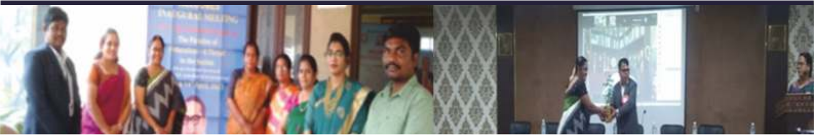
Faculty and students pose for a photo