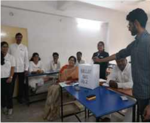
Students seen dropping their vote in the ballot boxes