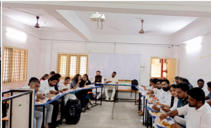
Mock Parliament House, Anantha Law College