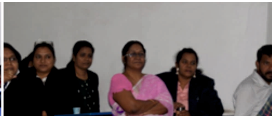
Faculty monitoring the essay writing competition Principal is seen observing the quiz competition