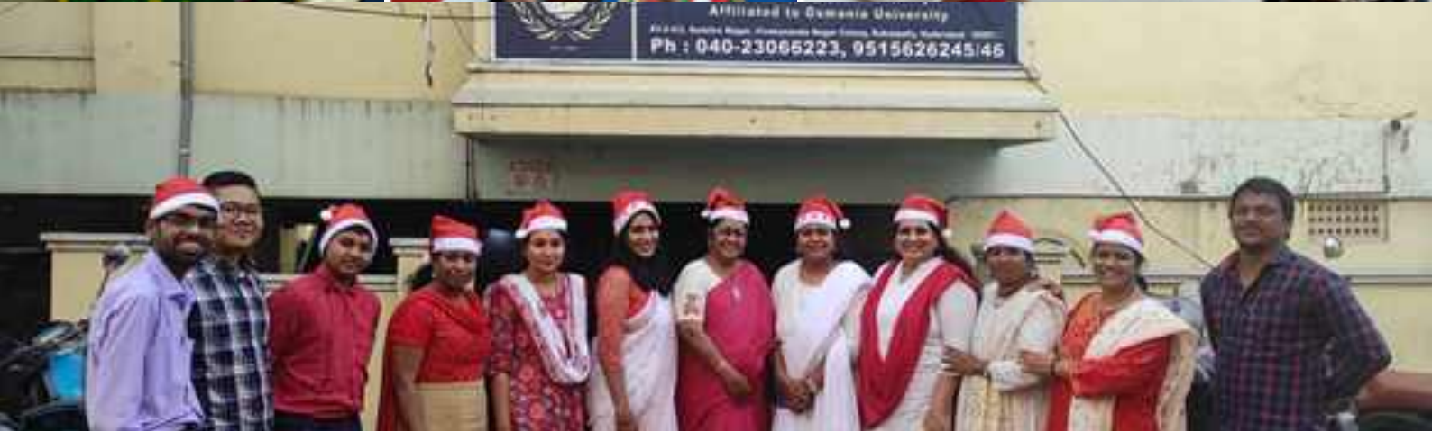
Team of Anantha Law College posing for a photograph as a part of Christmas Day celebrations