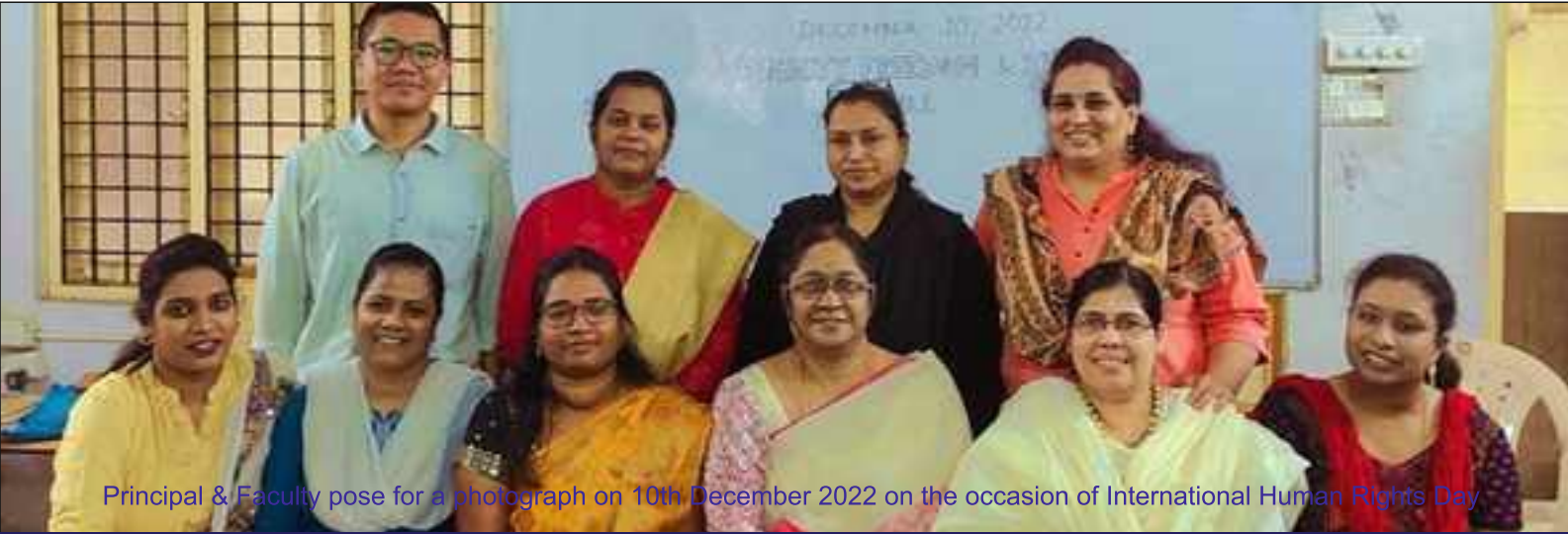
Principal & Faculty pose for a photograph on 10th December 2022 on the occasion of International Human Rights Day