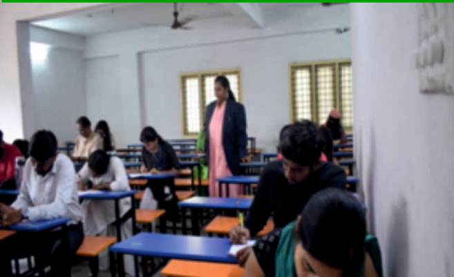
Faculty monitoring the essay writing competition