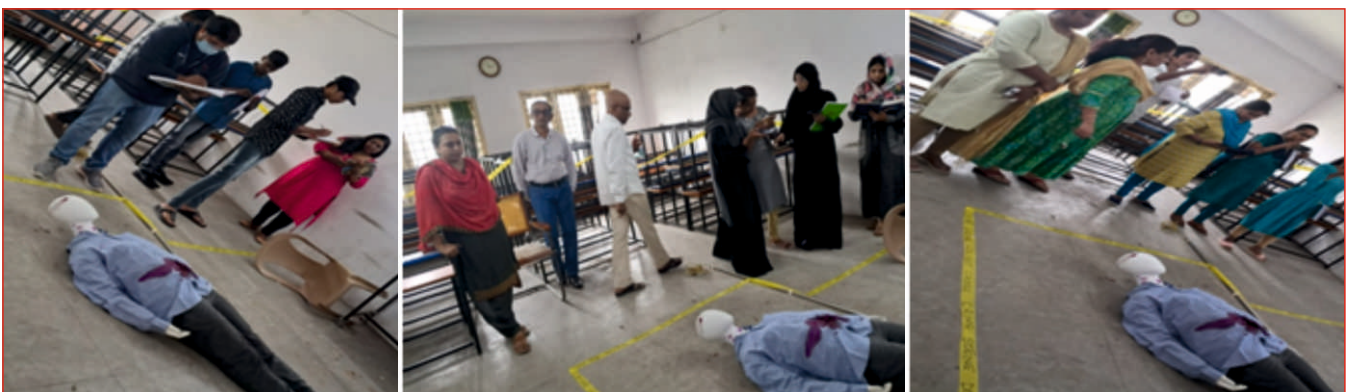
Students seen observing by batches