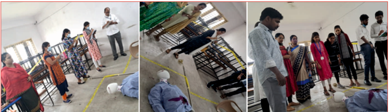
Students observing the crime scene

Students showed a lot of interest and participated with great inquisitiveness.