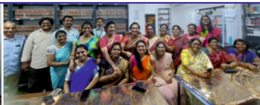
Teams of both colleges pose for a photograph