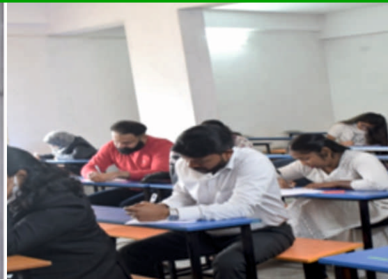
Students seen writing